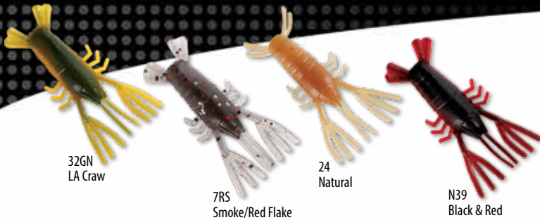
32GN LA Craw