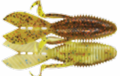
15BKO19BS-Louisiana River Craw