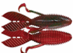
WMRS-Watermelon Fire Craw