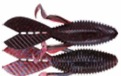
3RS9BS-Red River Special