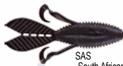
SAS-South African Special