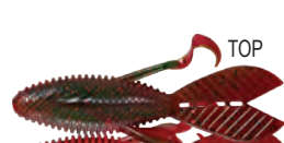
WMRS-Watermelon Fire Craw