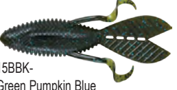
15BBK-Green Pumpkin Blue