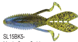
SL15BK5-Magic Craw Swirl