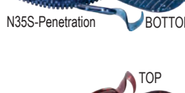
3RS9BS-Red River Special