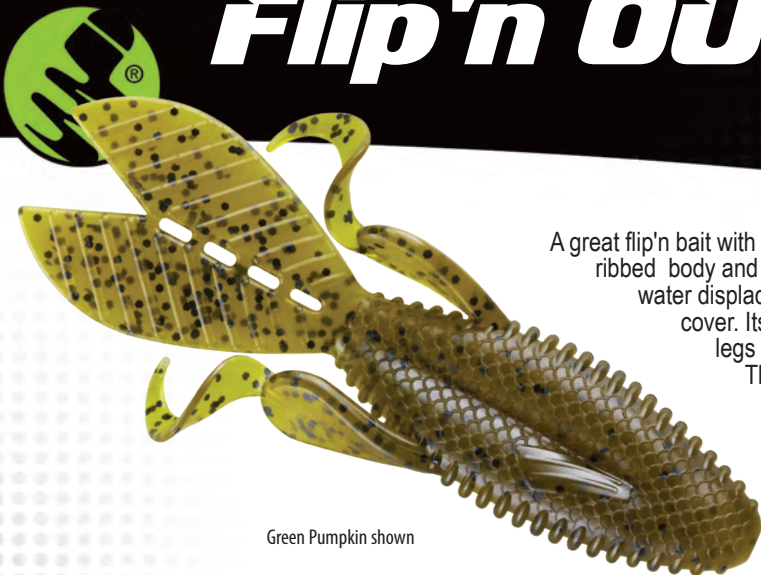
Green Pumpkin shown

A great flip'n bait with a soft, sturdy, compact, ribbed body and paddle appendages for maximum water displacement to help bass find an easy meal in thick cover. Its two longer claw-like paddles and Mister Twister® Curly Tail® legs generate a lifelike, fleeing motion that's irresistible. The body's recessed centerline creates perfect hook placement.