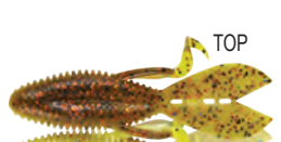
15BKO19BS-Louisiana River Craw