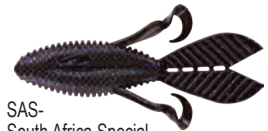
SAS-South Africa Special