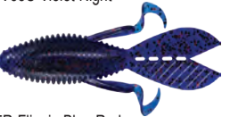
F5R-Flippin Blue Red