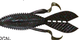
15PGN-Green Pumpkin Candy