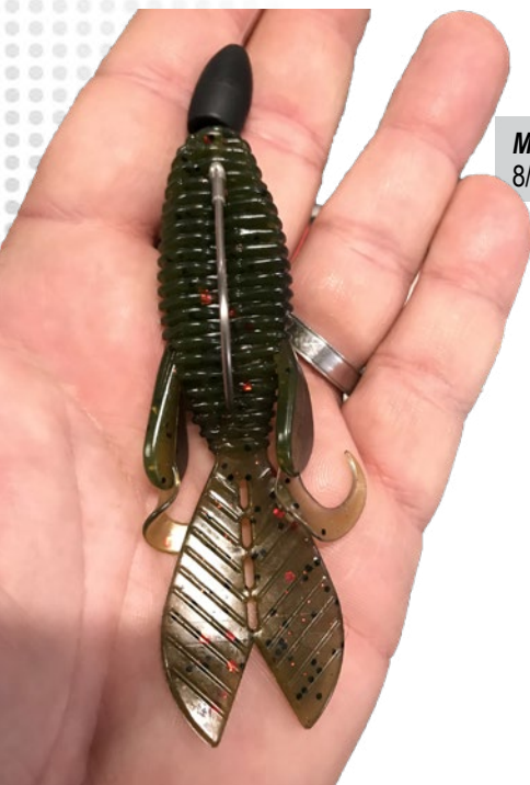
Elite Pro Clent Davis's go-to punching rig

What's one feature setting this bait apart? The body's smooth, scaled finish on one side, and deep, textured ribs on the other. By rigging the 4" Flip'n OUT with the hook on the smooth side the lure will fall a little faster than if rigged on the ribbed side. Testing revealed a 17% difference in the fall rate between the two rigging options!