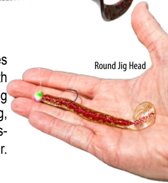
Round Jig Head

The 5" Poc't Phenom® combines the action of a Curly Tail® worm with the attraction of bubble-producing poc'its. Try swimming it on a jig, like a finesse swimbait, or Texas-rig it and drag it through cover.